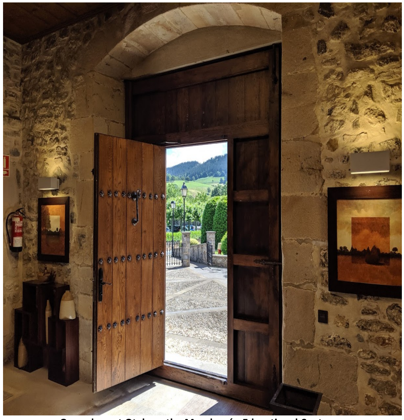
Open door at Otalora, the Mondragón Educational Center

Prepared for Praxis Peace Institute * www.praxispeace.org